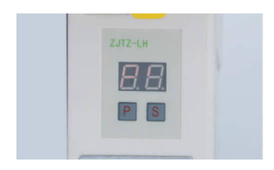
The speed could be adjusted very easily.