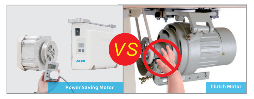
Direct drive, run safety.